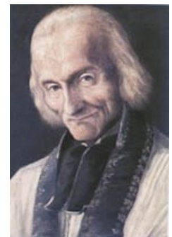
St. John Vianney

— Curato d'Ars. Scritti scelti . Rome: Citta Nuova, 1976, p. 72